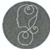
Community Leader G Day for Girls Victoria

facebook | twitter | instagram | pinterest