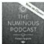
Producer + Host, The Numinous Podcast