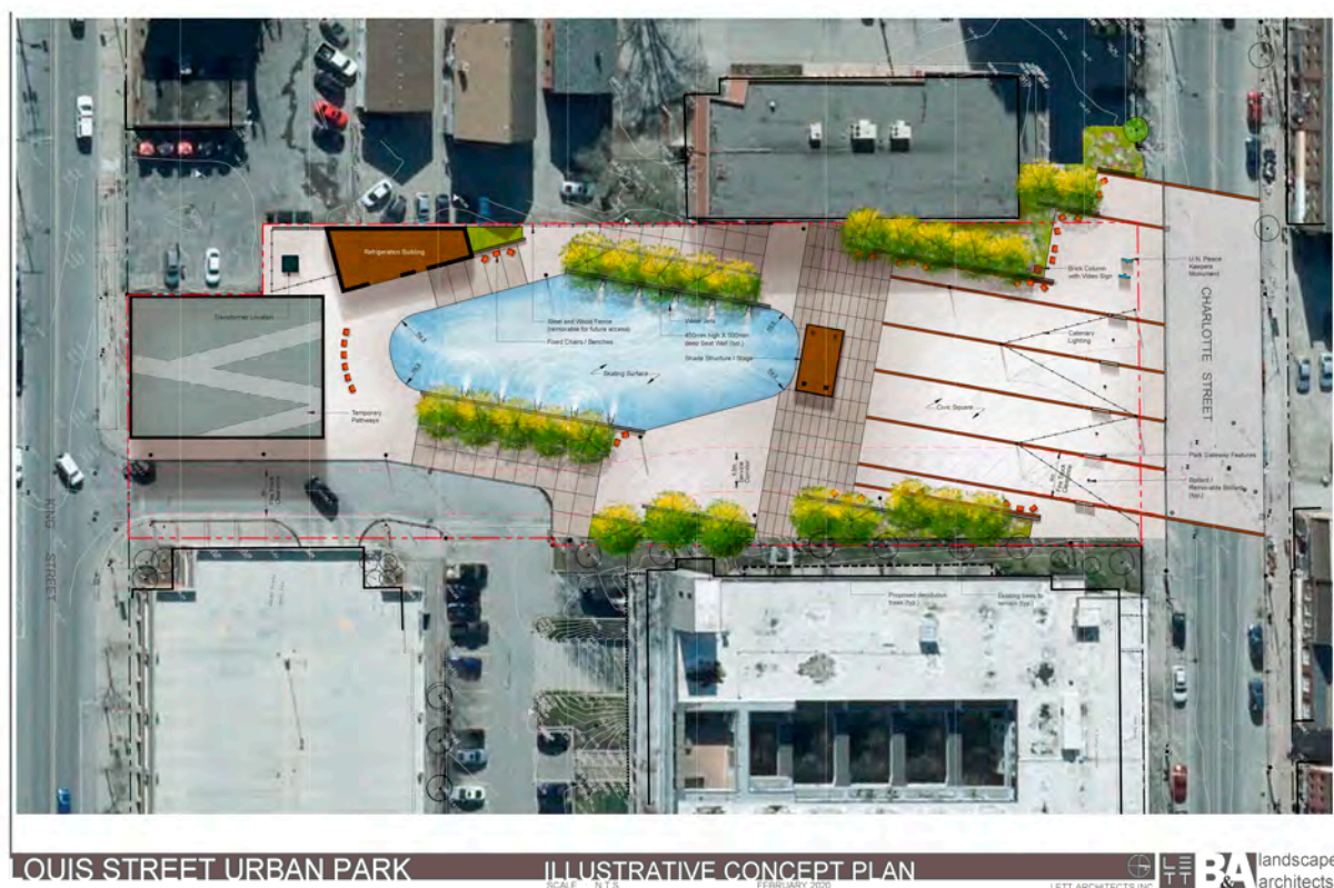
Figure 2. Proposed urban park conceptual plan.