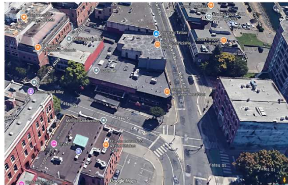
2 LCRB Application – Lucky Bar at 517 Yates Street | November 20, 2025