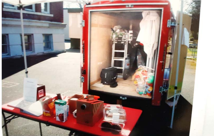
Mobile Community Trailer