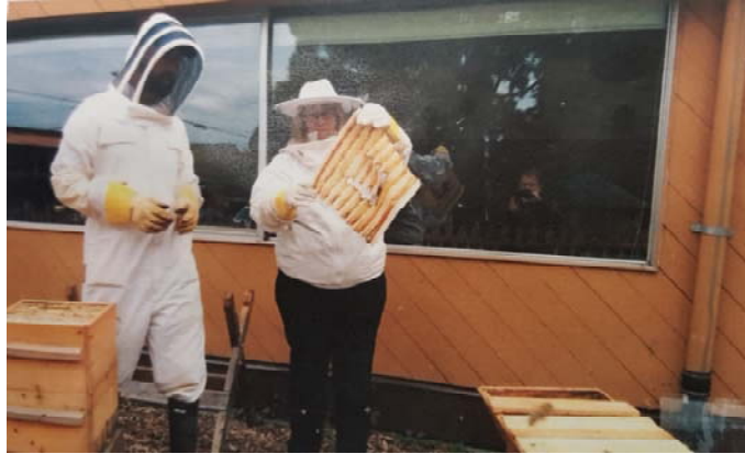
JBNH Pollinator Garden