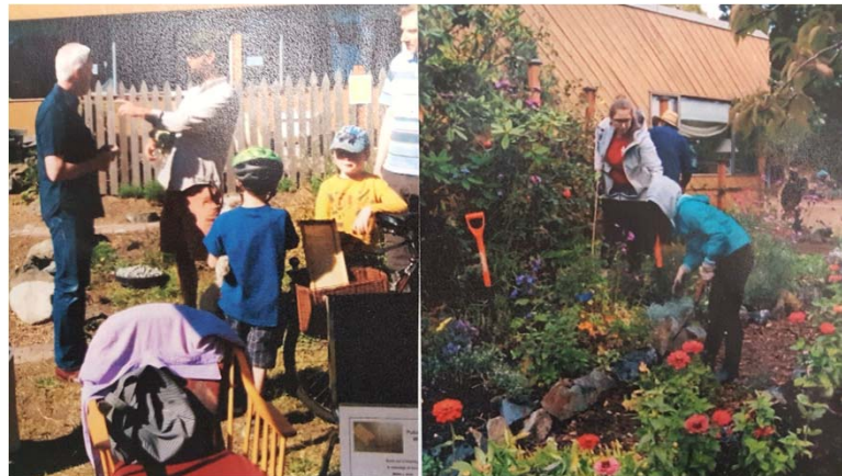
JBNH Pollinator Garden