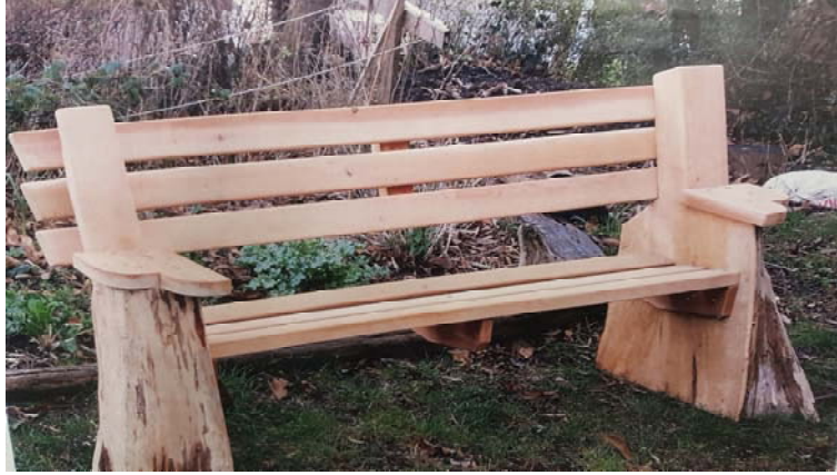
Fairfield Food Forest