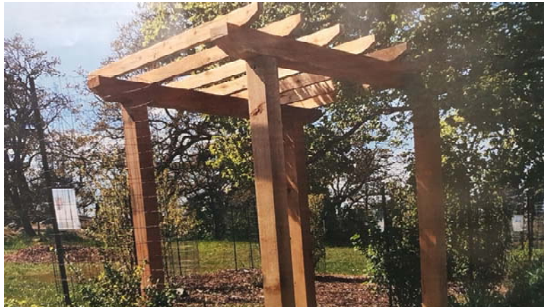
Fairfield Food Forest