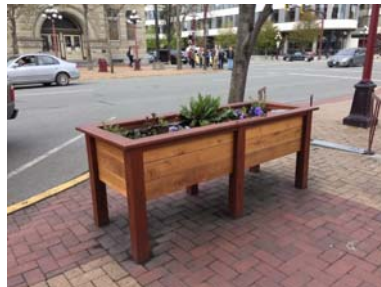
FED planter box