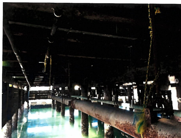
Suspended Services below pier