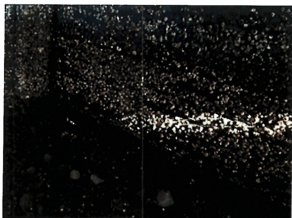
Deteriorated timber retaining wall