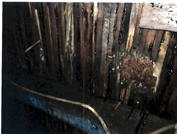
Damage to timber decking