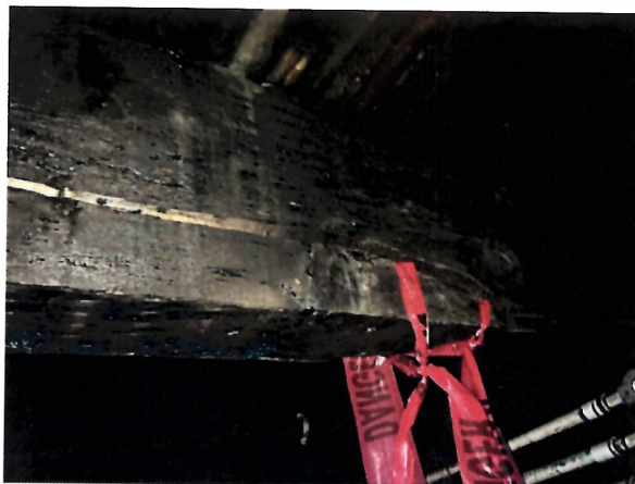
Damaged timber beam