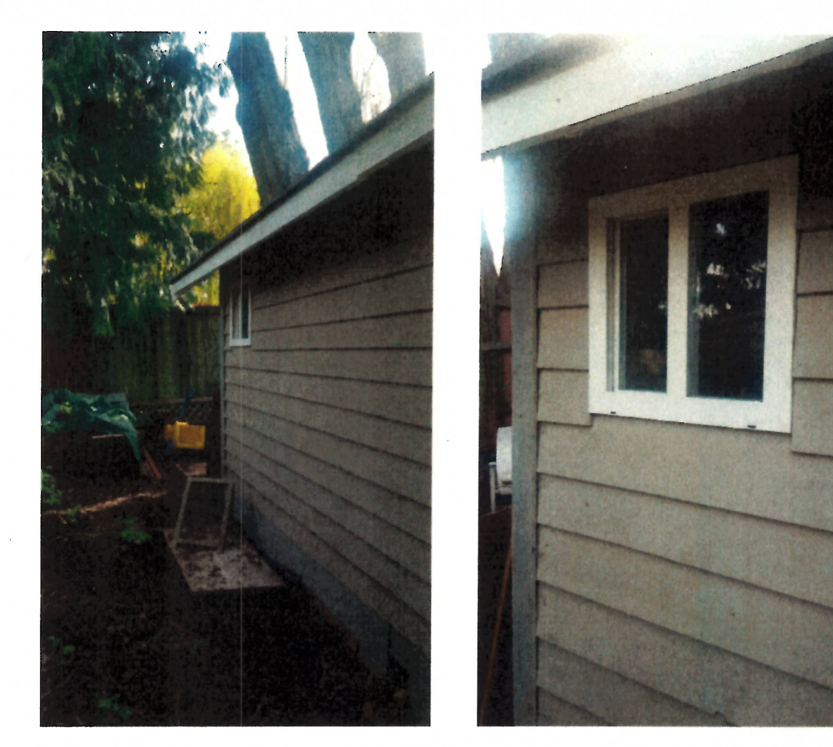
Fig. 4-5: East elevation showing small bathroom window