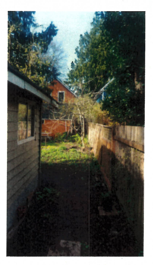
Fig. 2: East elevation with living area window and neighbours fence.