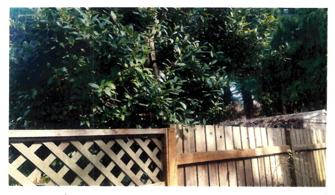
Fig. 3: Fence and mature tree on property outside of living area window

Fig. 2: East elevation with living area window and neighbours fence.