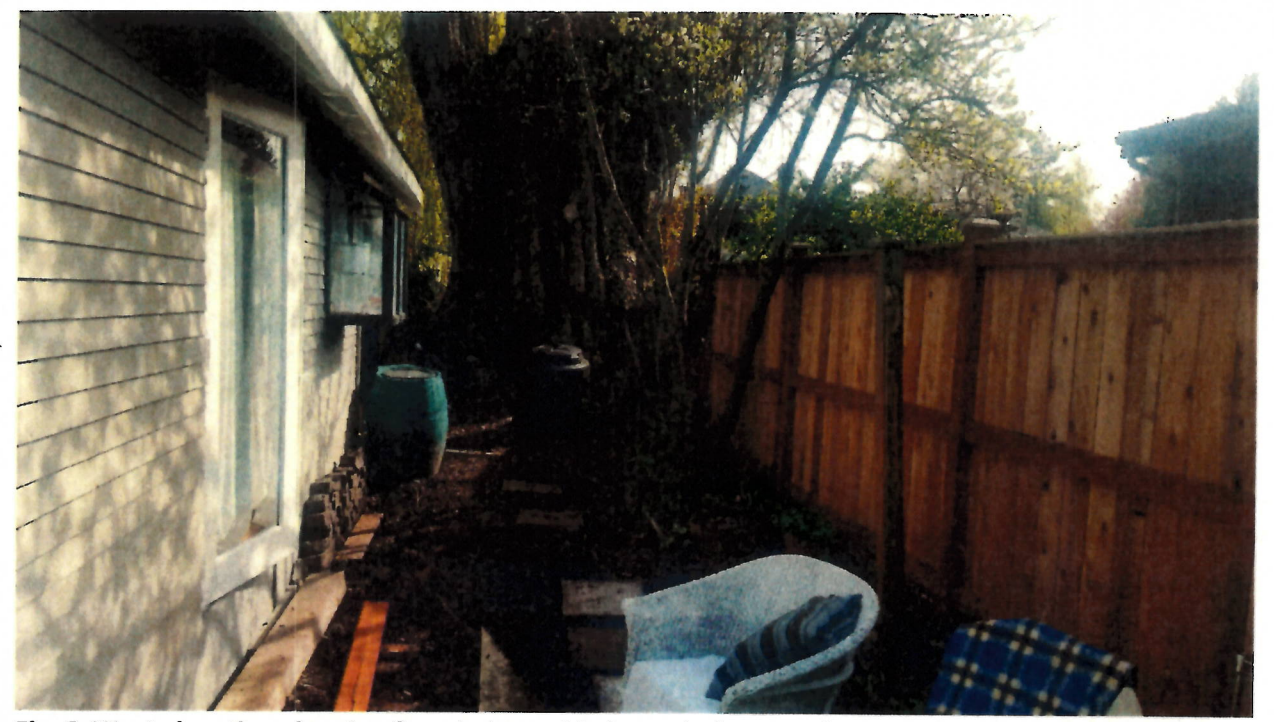
Fig. 6: West elevation showing french doors, kitchen window, outdoor space, and neighbours 6 foot fence.