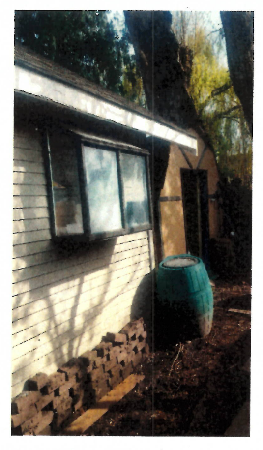
Fig. 7: Kitchen window on west elevation