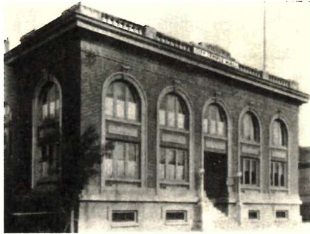
Knights of Pythias Hall