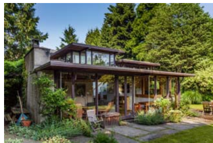
Words Baker House by Ron Thom, 1952