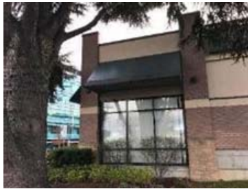
Existing canopies, corner of Bay St / Tyee Rd