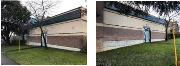
Elevation fronting Bay Street