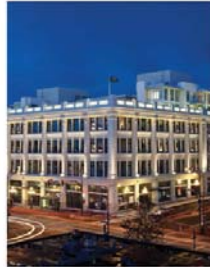
Compatibility Intent: Make new rooftop additions physically and visually compatible with the historic building.