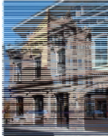
Meaningful Conservation and Enhancement Intent: Use new rooftop additions as an opportunity to meaningfully conserve and enhance the heritage character of the historic building.