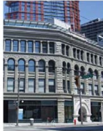
Hierarchy Intent: Make new rooftop additions subordinate to the historic building.