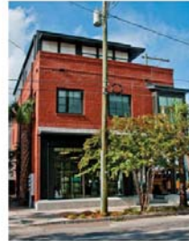
Distinguishability Intent: Make new rooftop additions distinguishable from the historic building.