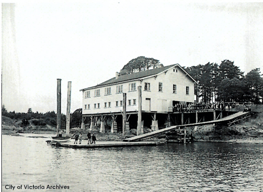
Rainbow Point at the Foot of Robert Street, 1942 Images of the Former James Bay Athletic Association Building during use by the Rainbow Sea Cadets.