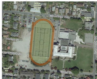
Concept plan for Victoria High School project