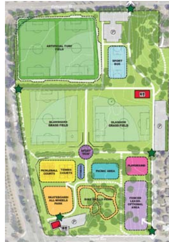
Approved concept plan