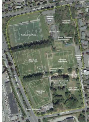
Current park layout