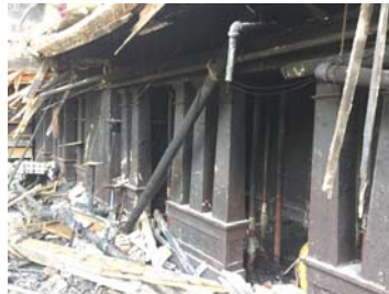
Decorative wood columns