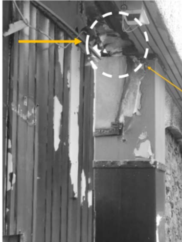
Initial Glimpse of Main Column #1 behind veneer