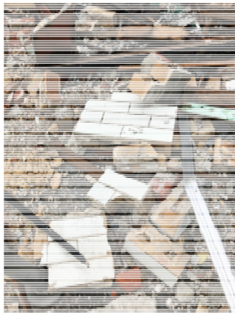
Samples of glazed bricks