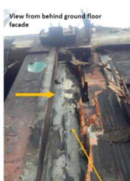
View from behind ground floor facade