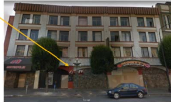
Location on building before fire