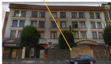
Discovery of main column #2 behind ground floor facade