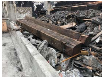
Old Growth Heavy Timbers