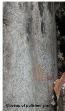
Closeup of polished granite