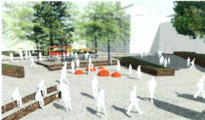
Plaza refresh design concept – stairs and upper plaza section

A draft design concept was developed based on the feedback received and in response to immediate operations and maintenance needs and incorporation of accessible grades. The design concept illustrates incremental improvements that would happen in advance of any major redevelopment of the parking structure and adjacent open space. Please refer to Attachment F for more details and design drawings.