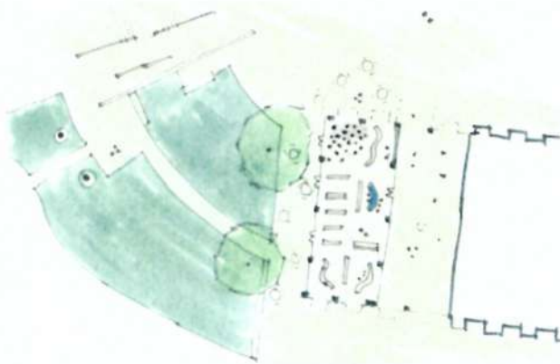
Example partial enclosure of undercroft for art gallery