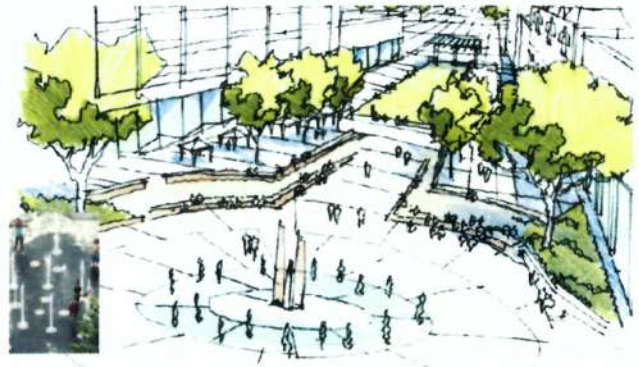
More simplified, flexible use plaza with central ramp