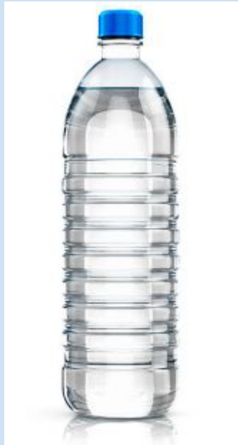
Plastic bottled water