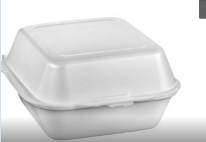
Styrofoam take-out food container