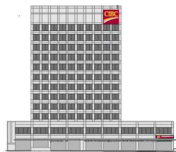
Proposed Signage North Elevation Cumulative Sign Display Surface Area: 38.26 m 2