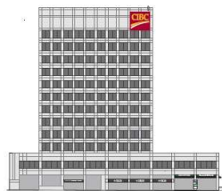
Existing Signage North Elevation Cumulative Sign Display Surface Area: 28.62 m 2 Area of all Visible Signs: 45.12 m 2

*Please note: Due to the technical interpretation of the sign display surface areas (in-set signs are not counted), the North elevation shows an increase, even though the actual amount of signage visible from the street has decreased when considering all visible signs.