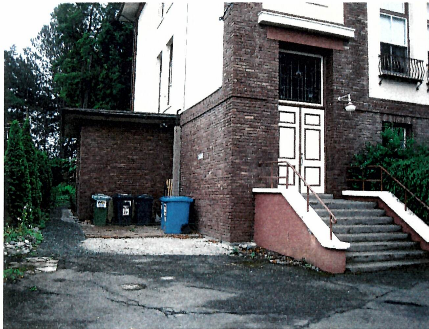
Space next to rear entrance where the bike shed is proposed