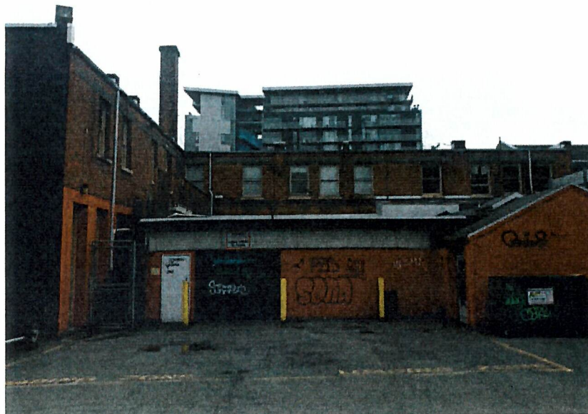
View of west (rear) and north (rear) interior elevations