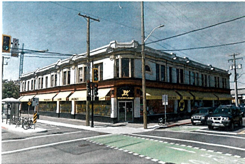
View of subject property from corner

1050-1058 PANDORA AVENUE & 1508-1518 COOK STREET