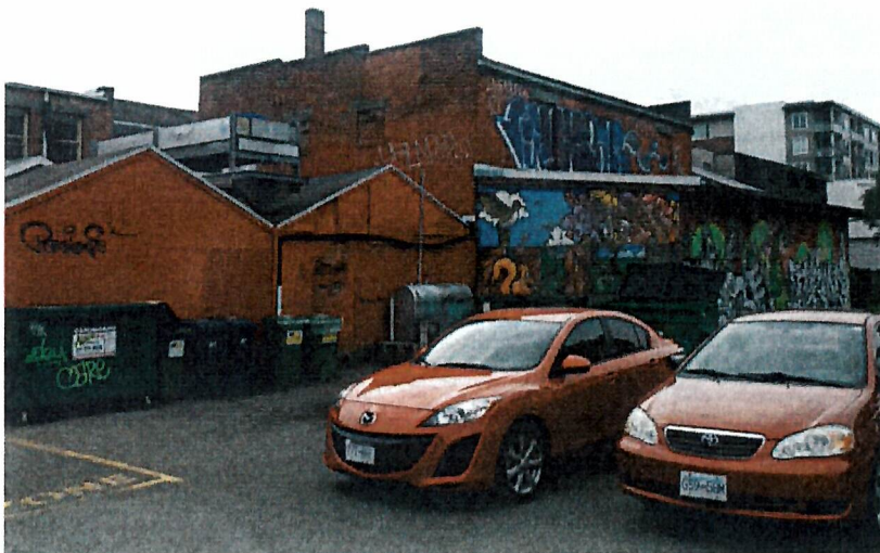
View of rear addition to Parkway Apartments Building

1050-1058 PANDORA AVENUE & 1508-1518 COOK STREET