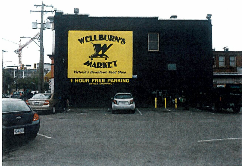
View of north (side) elevation

1050-1058 PANDORA AVENUE & 1508-1518 COOK STREET