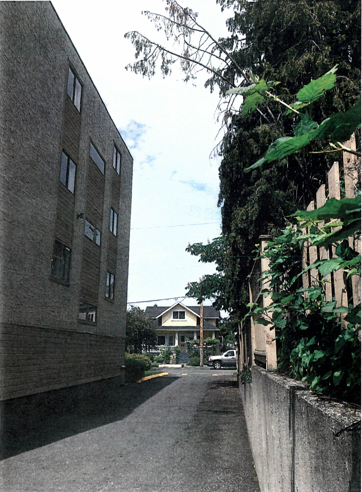
IMAGE FOUR: View from north-east corner of 1017 Queens. This driveway replaced the general store shown above.