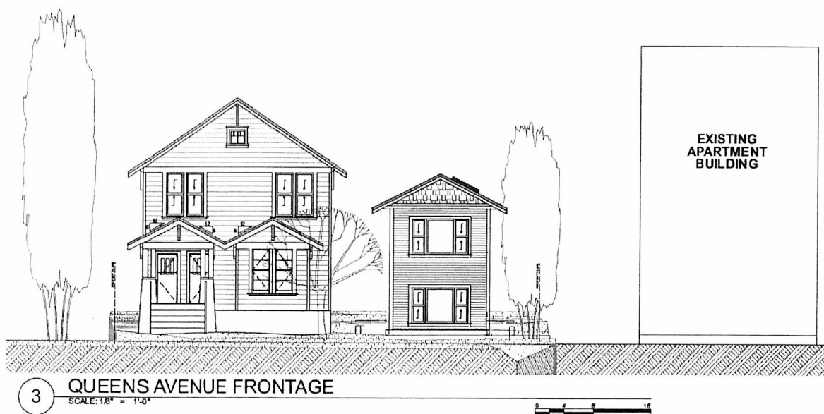
IMAGE TWO: Proposed carriage house will fill significant visual gap between 1029 and 1017 Queens.

This proposal will also facilitate much needed upgrades to the stormwater management system and the 100-year old sewer and water lines. An upgrade to the electrical service will also be required. The Carriage House will contain a sprinkler system to address spacial separation issues and allow lots of natural light and passive solar energy into its two units. Interconnected smoke alarms and CO2 detectors will enhance tenant safety. The gravel driveway will be upgraded to a permeable surface. A new driveway apron will bring the pedestrian realm up to standard.