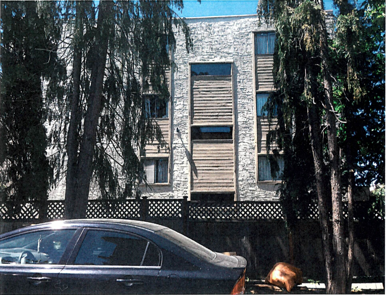
IMAGE THREE: View of apartment's east-facing windows from driveway at 1029 Queens. The centre column of windows is the apartment stairwell. The small windows on each side of the stairwell are probably bedrooms (the curtains are rarely open).