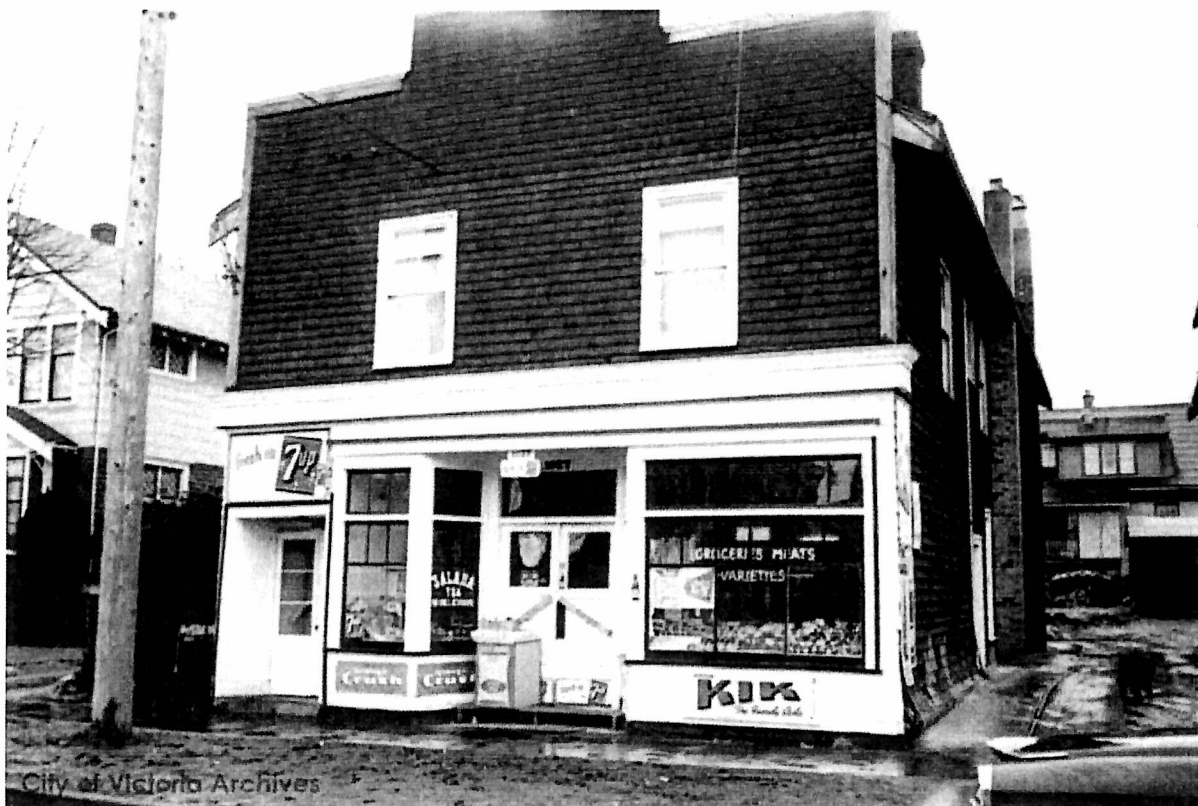
IMAGE ONE: Former general store at 1027 Queens (grocery store with apartments above). The location of this general store is now the driveway for the apartment building at 1017 Queens. The main house at 1029 Queens is visible on the far left of the image.