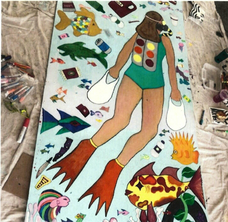
"Everything you Throw Away Goes Somewhere"

In partnership with seven social service organizations and led by the Coalition to End Homelessness Youth staff, the City worked throughout the summer on a number of initiatives driven from feedback gathered from the 30-40 youth in the Square. Drop in doodling sessions, bbq's and mural making were the key deliverables from the first six months of engaging with youth. A mural with a climate action focus was completed and will be installed in Centennial Square in January 2020.