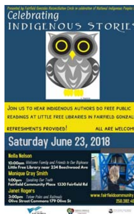
Reconciliation activity in Fairfield