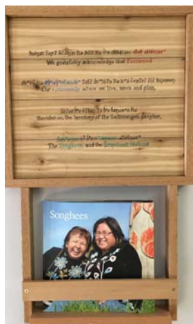
Acknowledgement plaque in Fernwood Community Centre