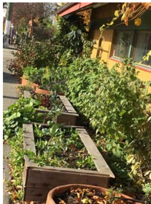
Wall mural and children's garden in Fernwood