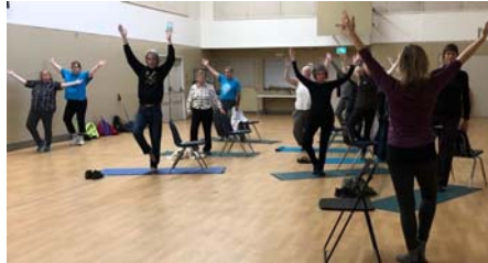
Yoga and high tea