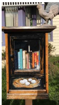
Free little library