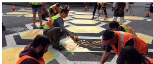
McCaskill Street Road Mural