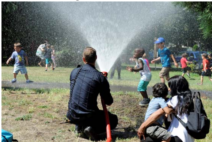
James Bay Community Picnic