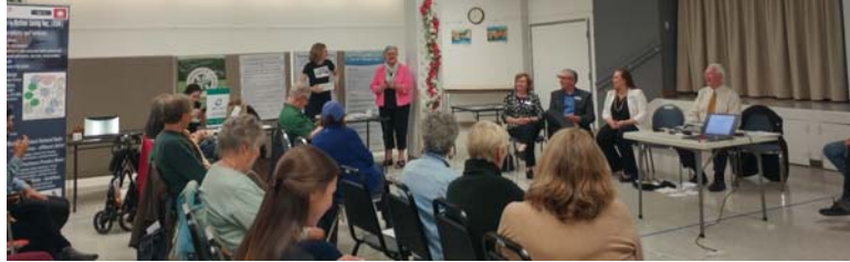
Co-op café workshop