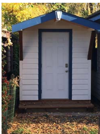
Community tool shed