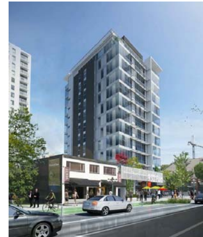
930 Fort Street- $67,668 (*Pending*)