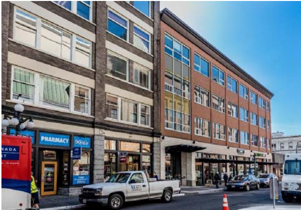
615-635 Fort Street- $19,124

Existing and pending contributions- $218,080.20