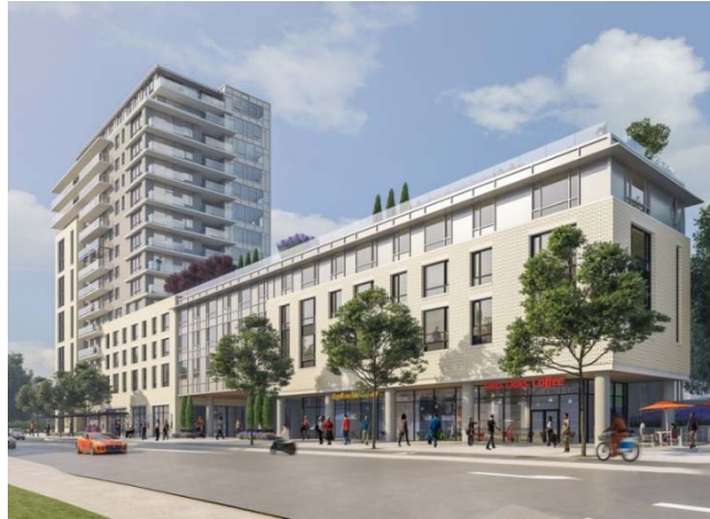
701 Belleville Street- $59,321