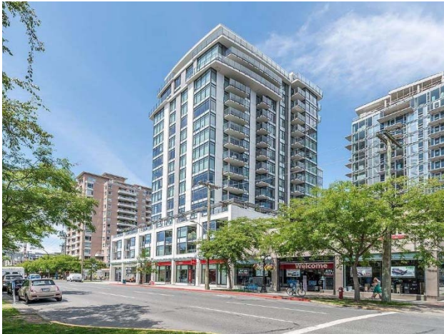
960 & 962 Yates Street- $65,437