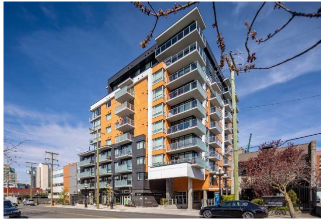
836 Broughton Street- $2,500