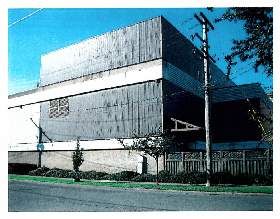
Side (south) elevation print reel room