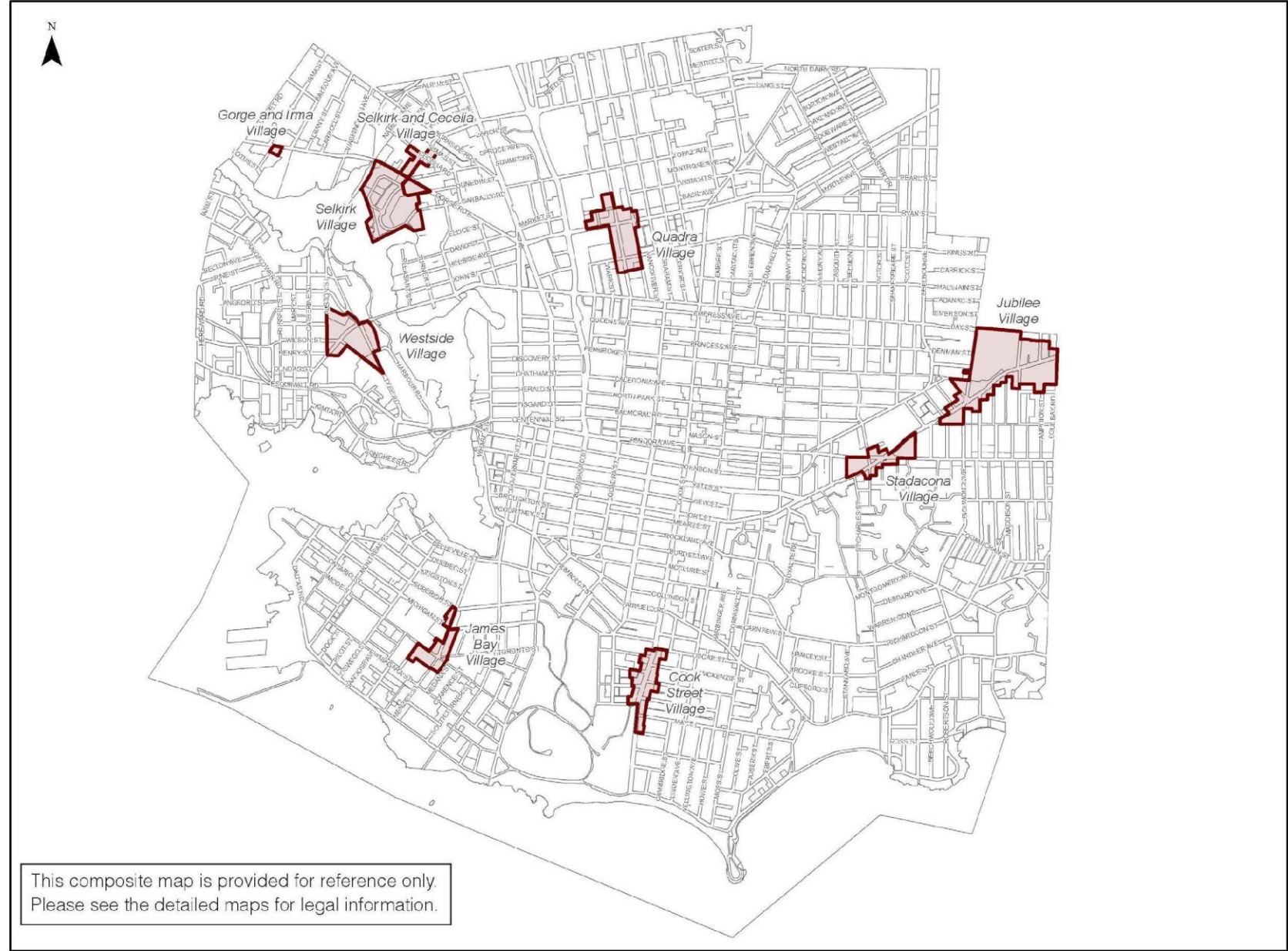
Map 39: DPA 5: Large Urban Villages