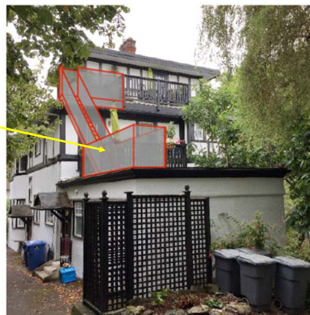
5 VIEW FROM NORTH-WEST A-1 With sketch overlay