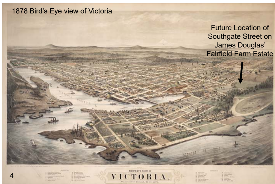
1878 Bird's Eye view of Victoria