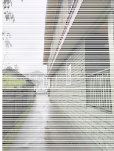
Side (west) Elevation