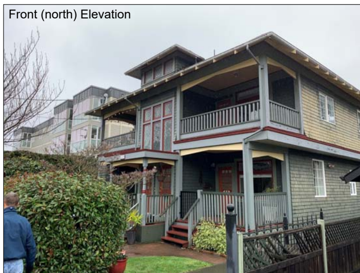
Front (north) Elevation