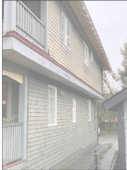
Side (west) Elevation