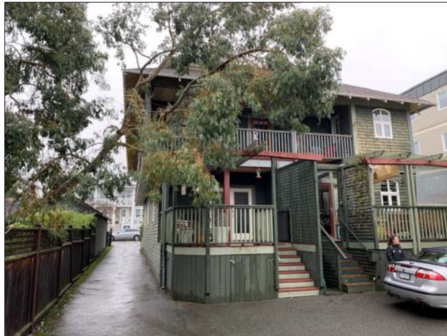
Rear (south) Elevation