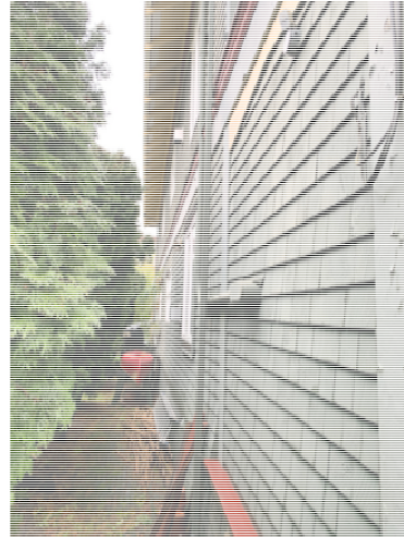
Side (east) Elevation