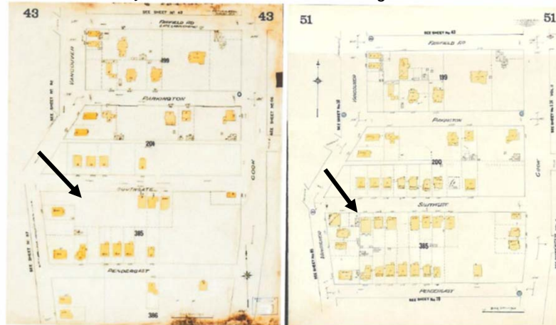
1913- Southgate Street is filled in