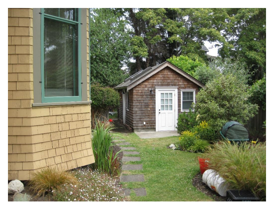
South side of property - Building A (Proposed Garden Suite)