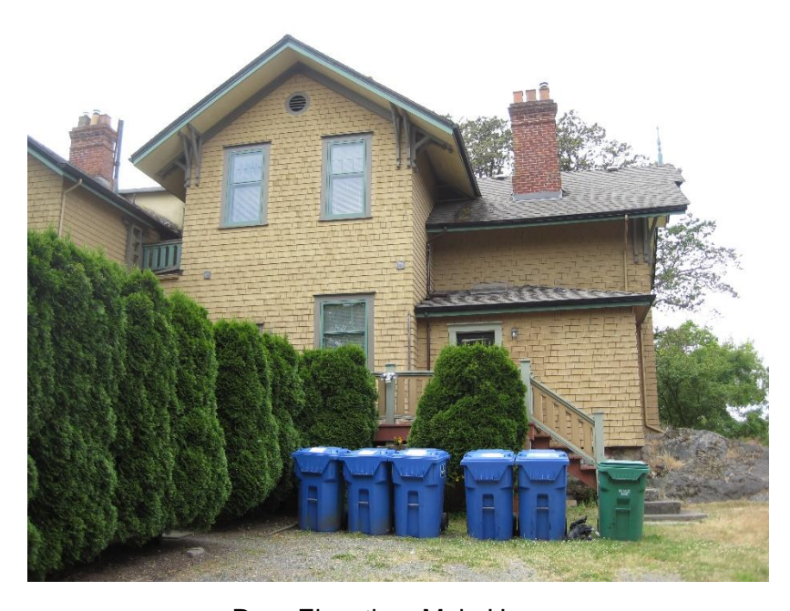
Rear Elevation, Main House