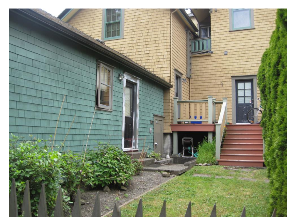
Rear Elevation - Main House viewed from laneway