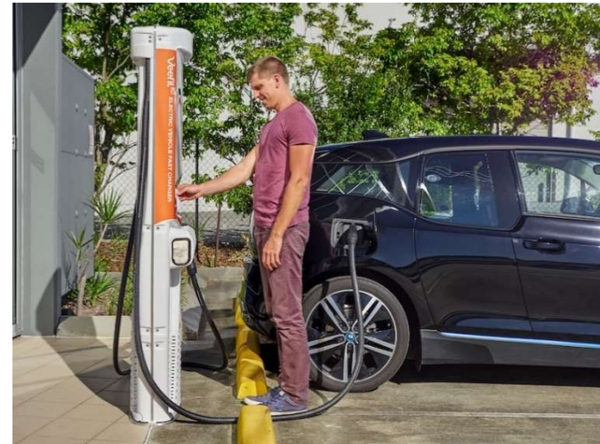
COLLECTING FEES FOR EV CHARGING