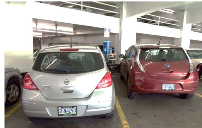
COLLECTING FEES FOR EV CHARGING