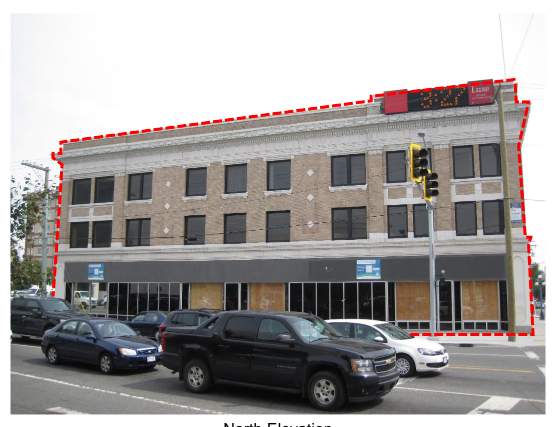
North Elevation Note: Designation excludes digital sign