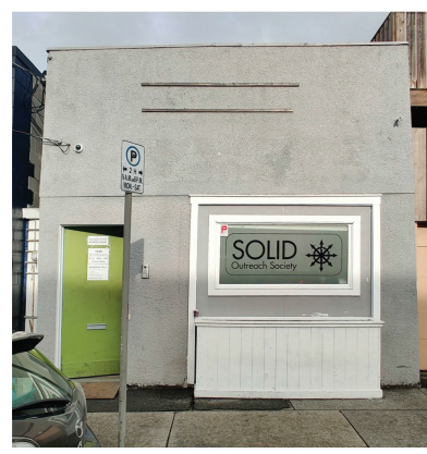
3 South Elevation (NO SCALE)