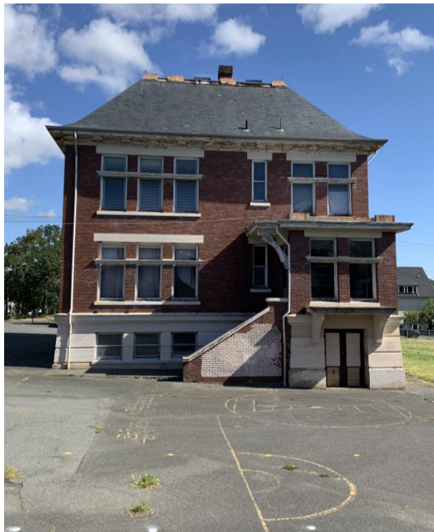
Rear (south) elevation