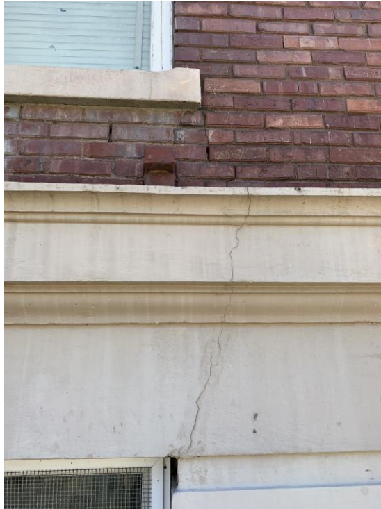
Crack in Brickwork