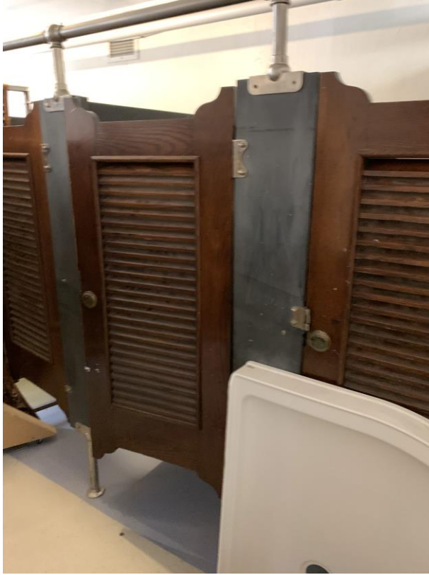
Washrooms with Slate Dividers at Ground Level