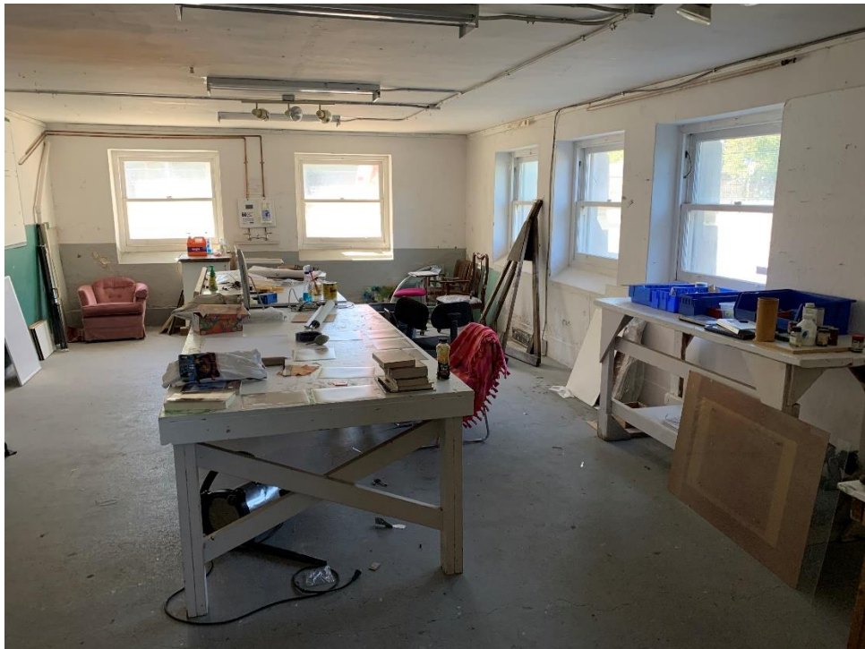
Basement Workshop Area