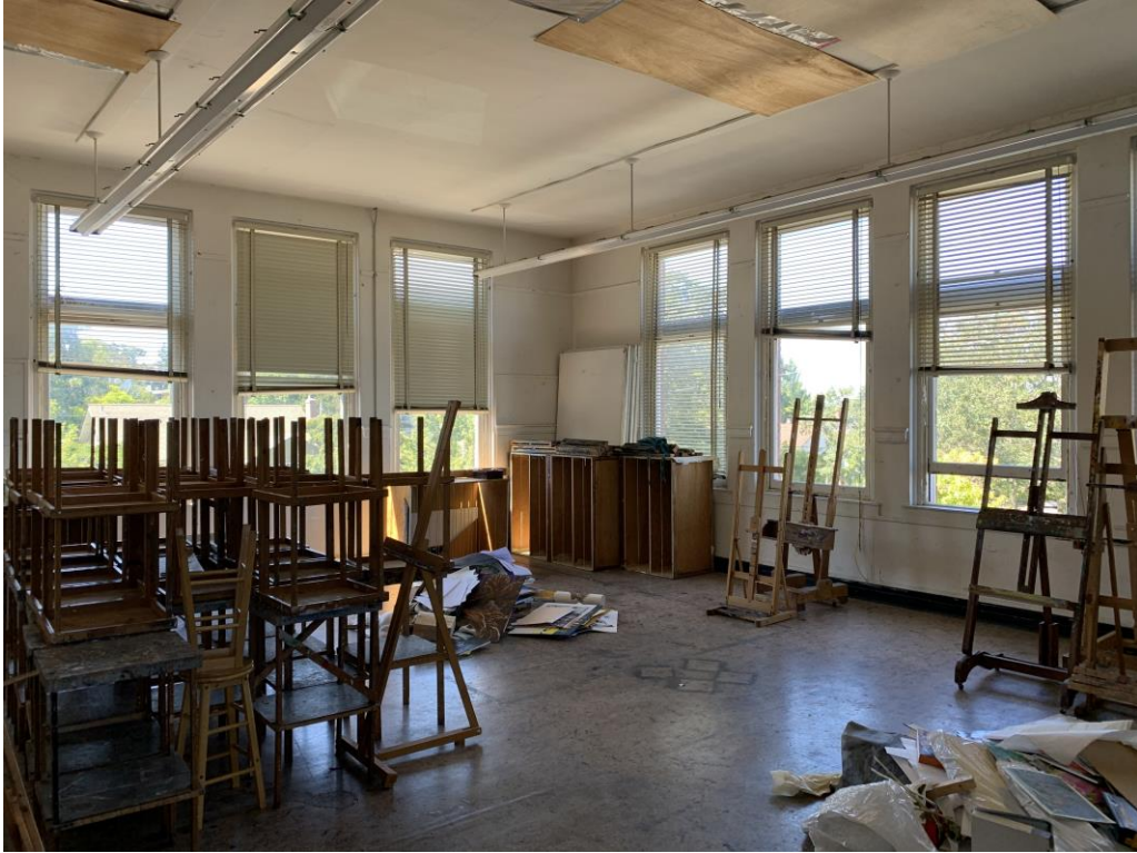
Classroom on Upper Storey