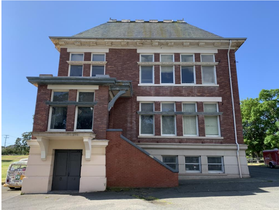
Side (north) elevation