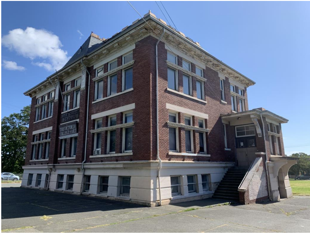
Front (West) and Rear (south) Elevation