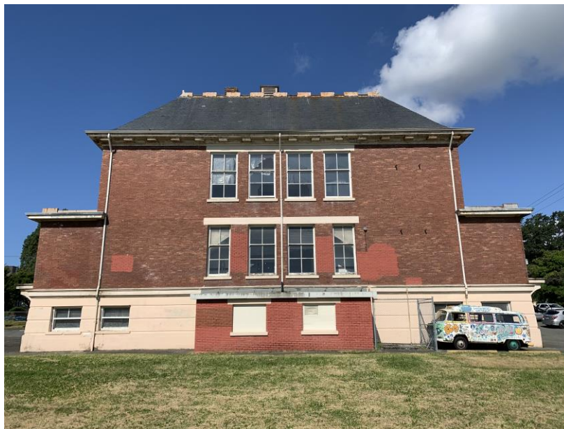
Rear (East) Elevation