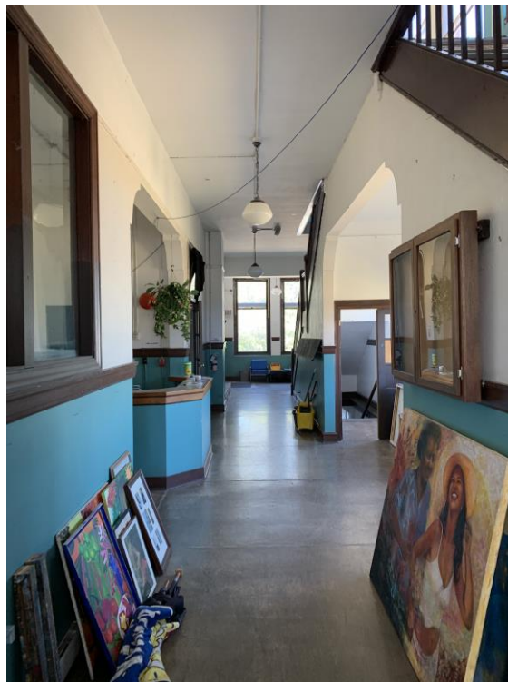
Second Storey Hallway