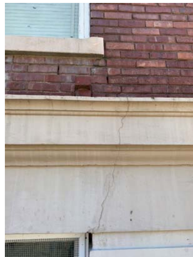
Spider crack in foundation