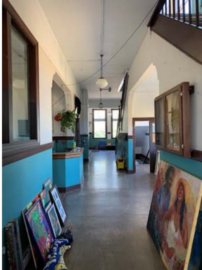
Second Storey Hallway