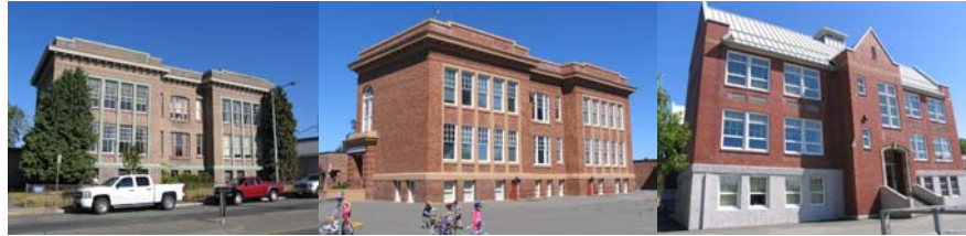
Burnside School- 3130 Jutland Road (1913 wing)