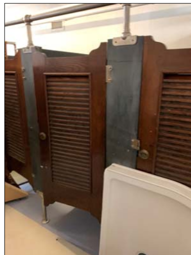
Washrooms with Slate Dividers at Ground Level