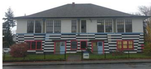
Quadra Primary School- 2549 Quadra Street (1921)