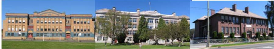
George Jay Elementary School- 1118 Princess Avenue (1909 Wing)