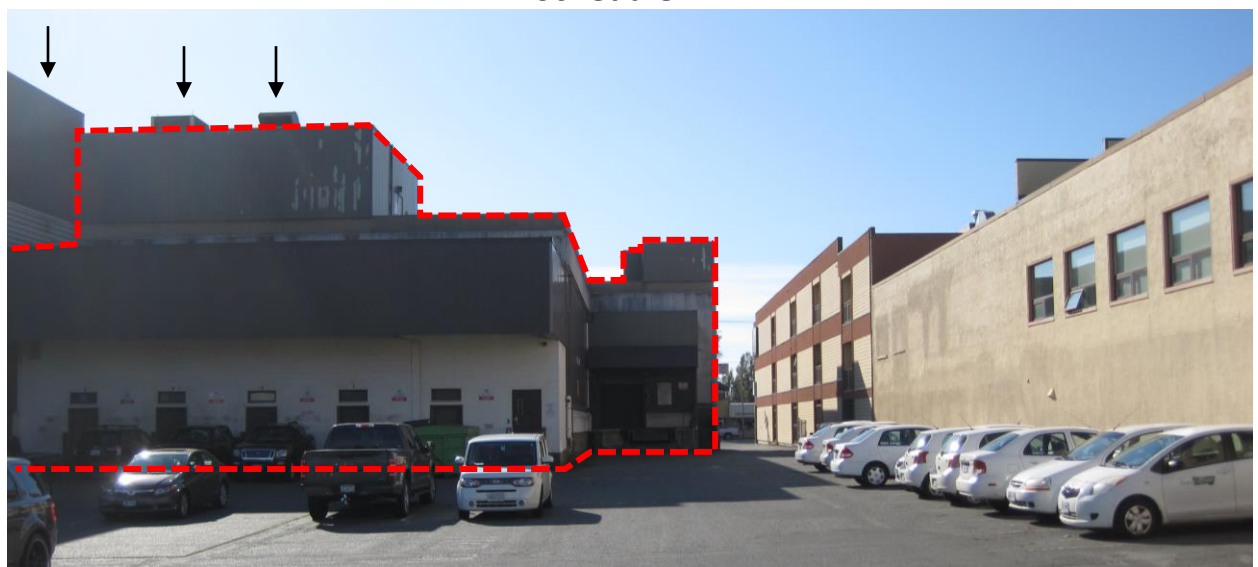
Rear (East) Elevation and Side (North) Elevation Note: Designation (red outline) excludes print reel room and rooftop mechanical equipment indicated with the arrows