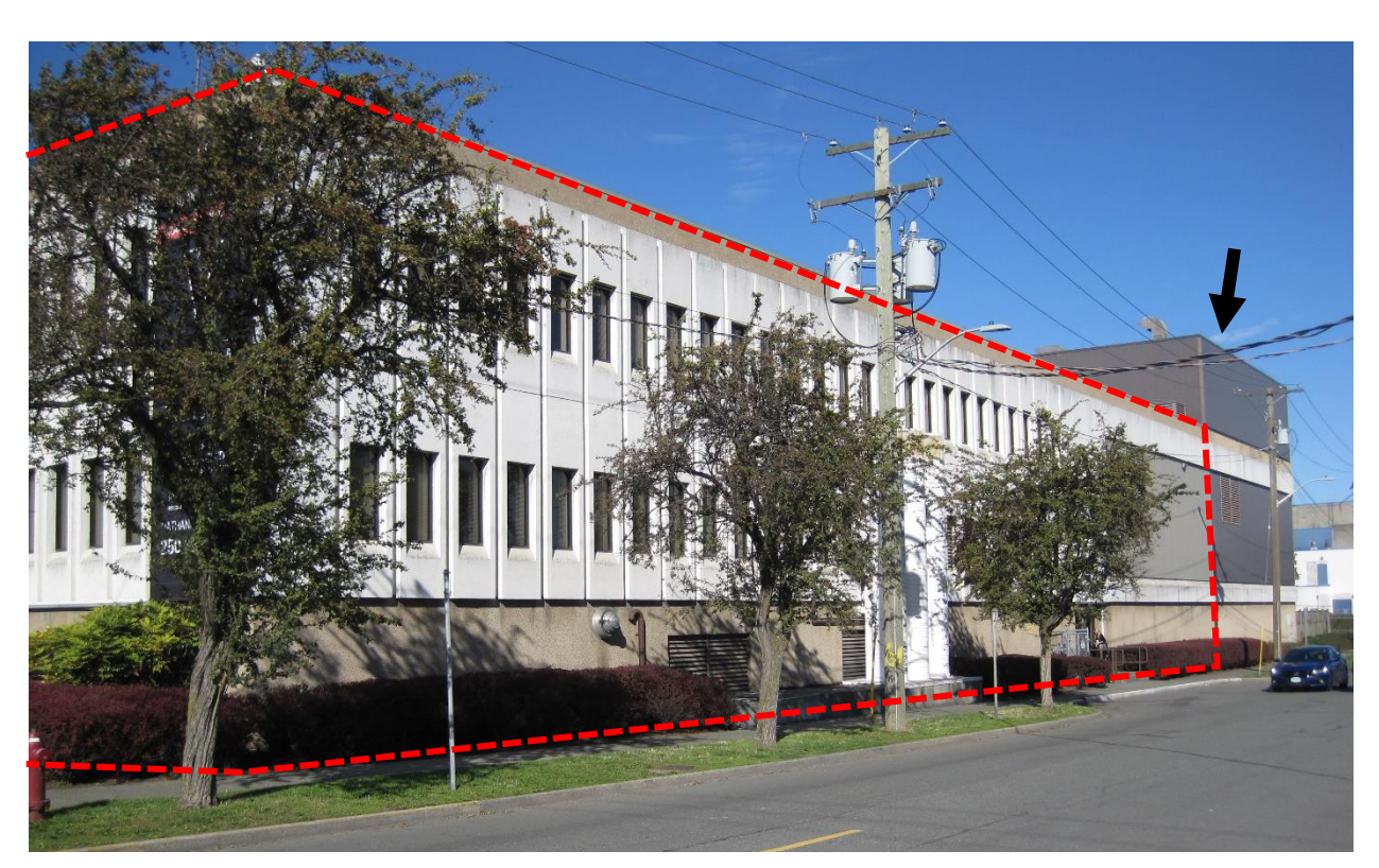
Side (South) Elevation Note: Designation (red outline) excludes print reel room (indicated with arrow) and landscaping