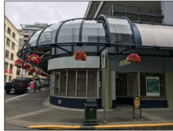
4 SOUTH ELEVATION SCALE: NTS