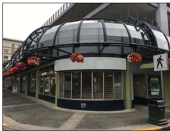
4 SIGNAGE ELEVATION SCALE: NTS