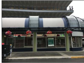
3 WEST ELEVATION SCALE: NTS