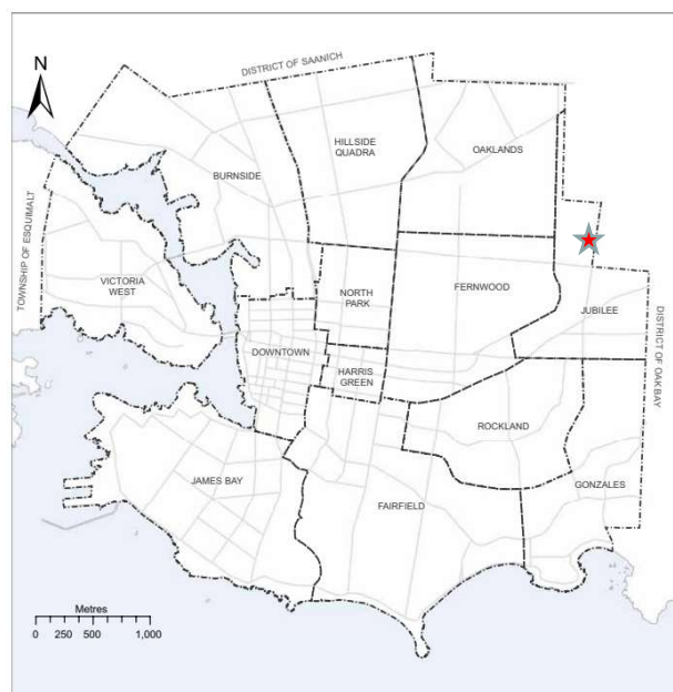
MAP 18 Neighbourhoods