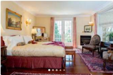
Hotel room · 1 bed Zanzibar Suite at the Villa Marco Polo Inn $162 / night

More places to stay in Victoria: Apartments · Bed and breakfasts · Lofts · Villas · Condominiums