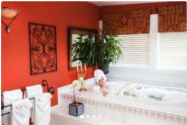
Hotel room · 1 bed Persia Suite at the Villa Marco Polo Inn $162 / night