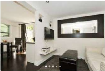
Hotel room · 1 bed Deluxe Suite with Terrace $172 / night