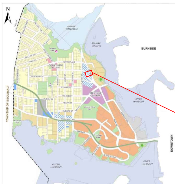
MAP 31 Victoria West Neighbourhood