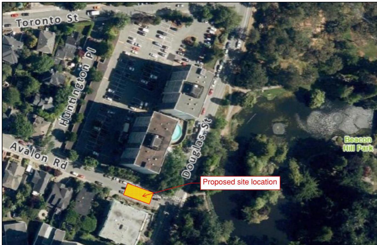
Figure 1: Shows the proposed location of the Community Care Tent.