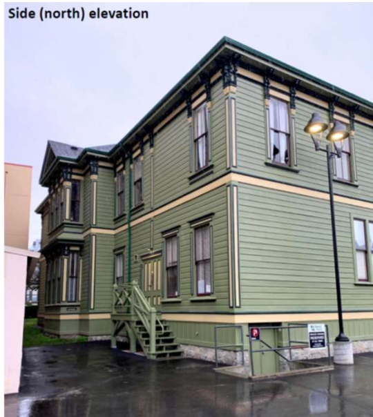
Side (north) elevation