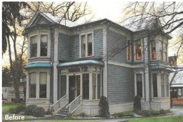
506 Government Street