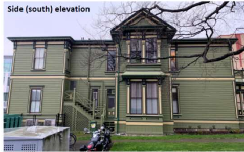
Side (south) elevation