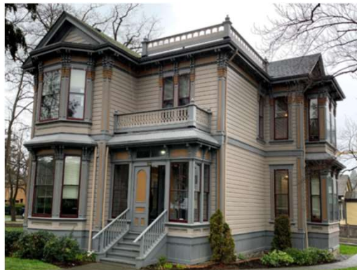
506 Government Street

That Council authorize City Legal staff to modify Covenants CA3641378 and CA3641382 to remove clauses concerning the heritage restoration of 506 and 514 Government Street.