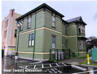
Rear (west) elevation