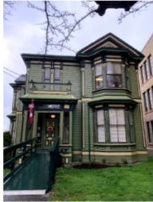
Front (east) elevation