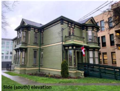
Side (south) elevation