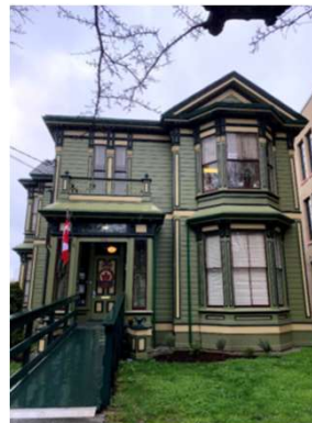
514 Government Street.