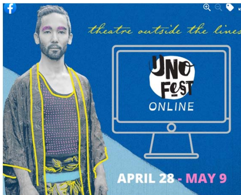
Uno Fest 2020

Key evaluation criteria considered include: