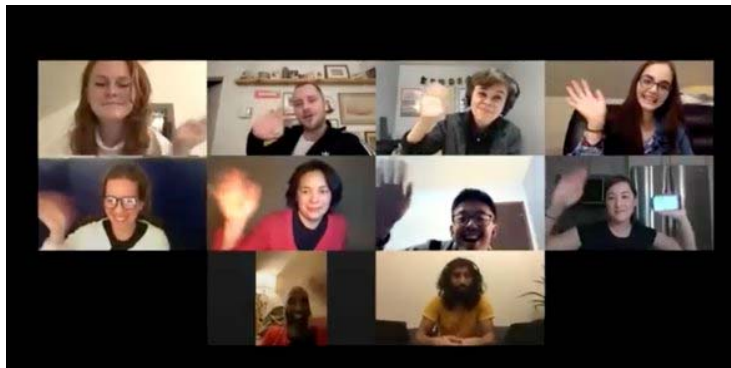
Peek Fest 2020

The purpose of this report is to seek Council's approval on the Festival Investment Grants recommendations for 2021.