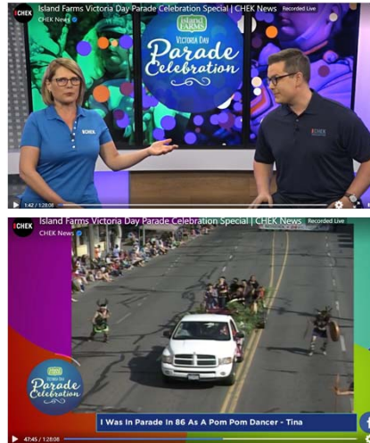
Victoria Day Parade 2020