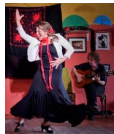
Flamenco Festival 2020