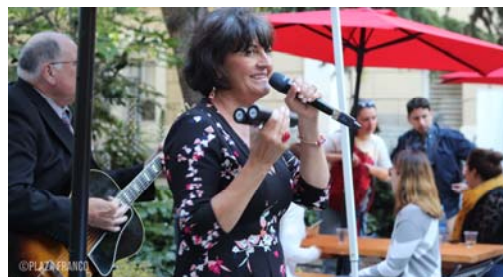
Plaza Franco 2020

That Council approve the Festival Investment Grant allocations as recommended in Appendix 1 for total cash grants of $268,550 and in-kind City services allocations of up to $100,550.