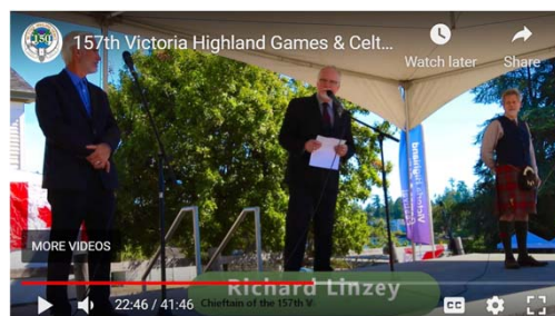
Highland Games 2020