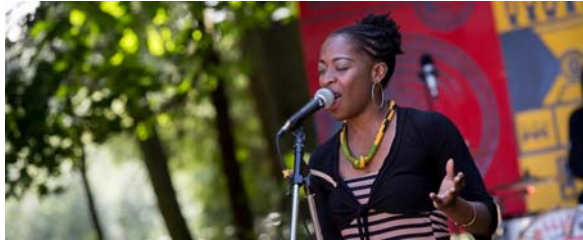
Ska and Reggae Fest 2020