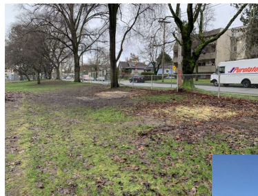
Central Park before and after restoration