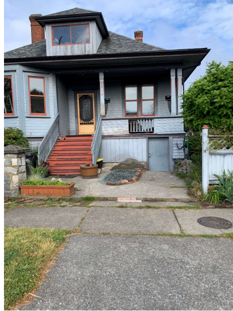
Photo of subject site