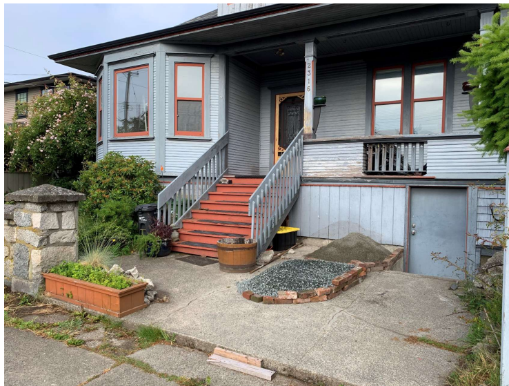
Photo of subject site