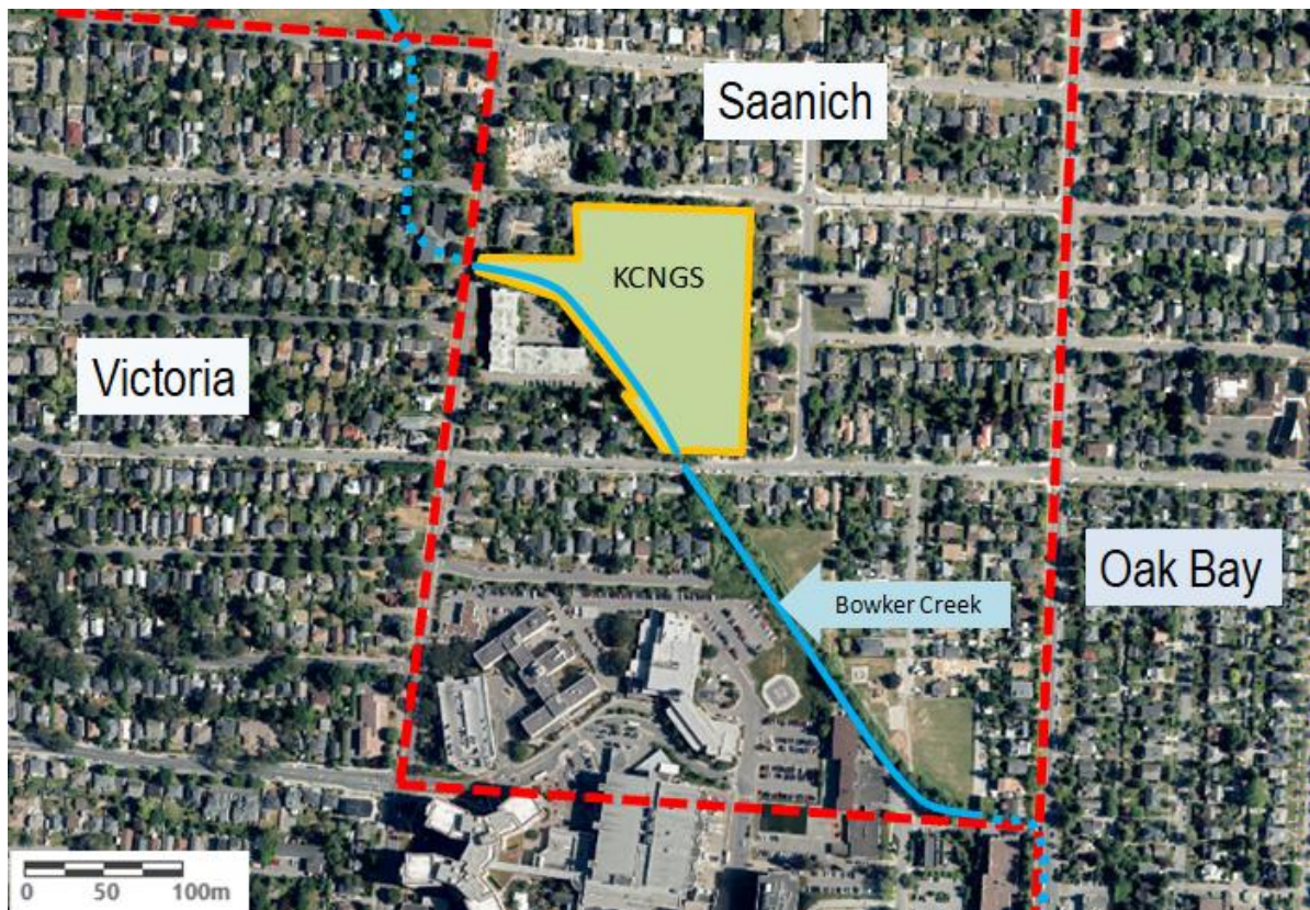
Map 1. Proximity of the KCNGS to Victoria and Oak Bay and Jubilee Hospital