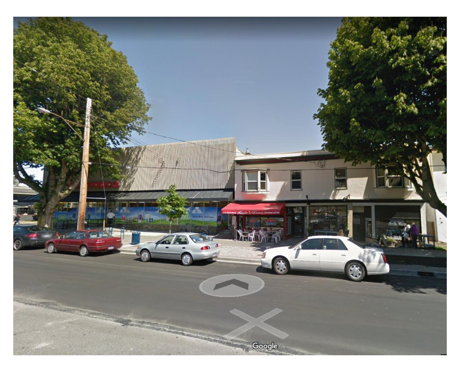
247 Cook Street – Second Floor Bay Windows Encroachment