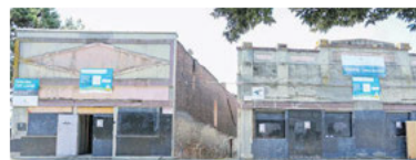
The Gold Rush warehouses near the Johnson Street Bridge. As part of its redevelopment plans, Reliance Properties says it will reproduce what their new stucco-covered facade is believed to have looked like originally.

>See WATER, A2 >Drought raises fire danger, A4