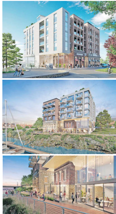
Artist's renderings of the proposed redevelopment of the Northern Junk buildings on Wharf Street. RELIANCE PROPERTIES

After facing risk and ruin for more than four decades, our collective chance to save Northern Junk is now.