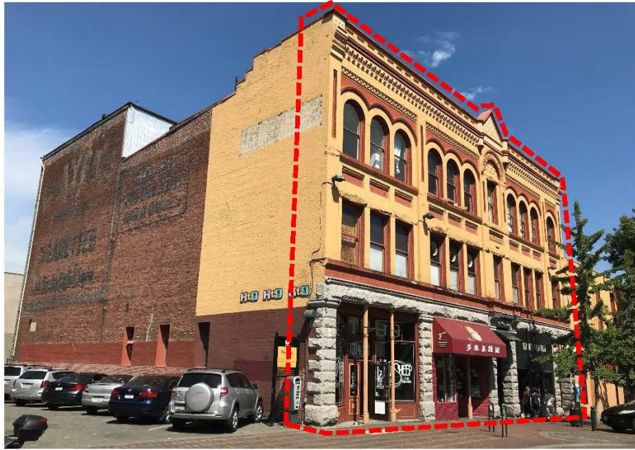
Photographs of Front Elevation Subject to Heritage Designation