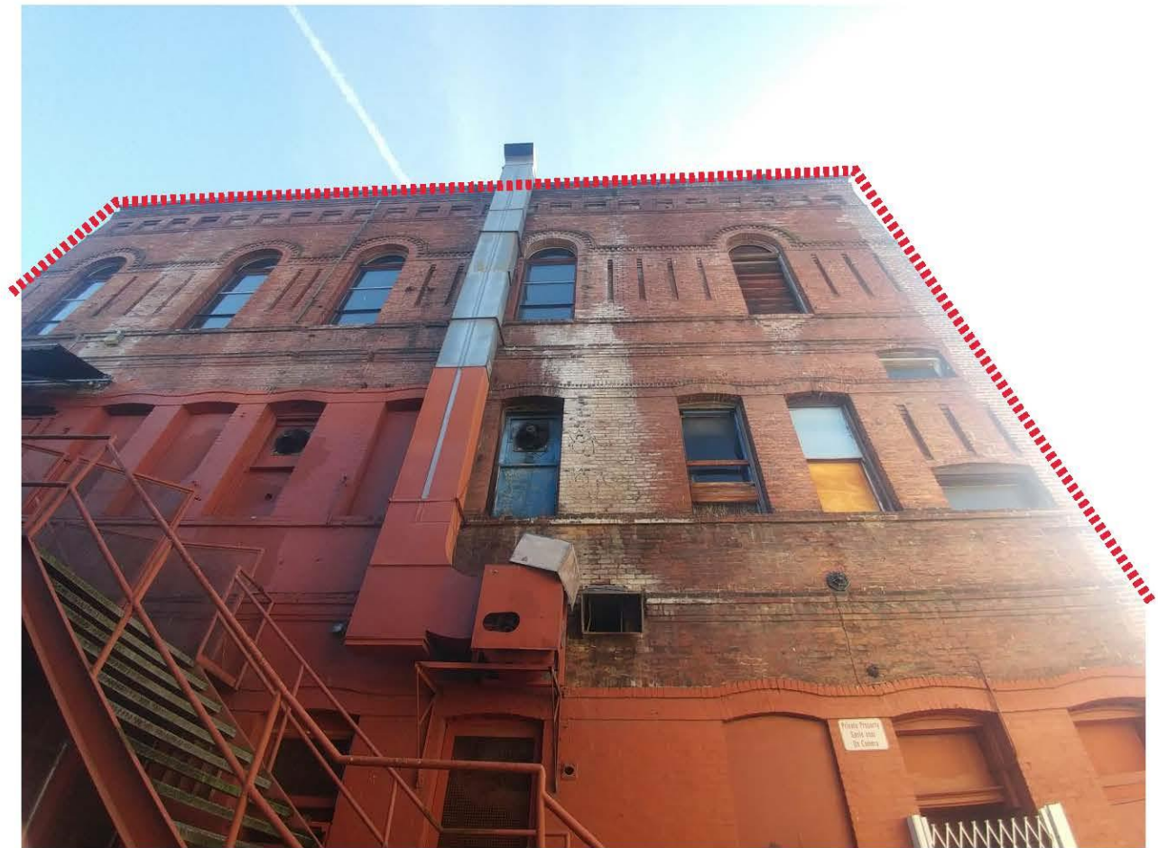
Photograph of Rear Elevation Subject to Heritage Designation

Note: The metal vent, steel exterior stairs and other mechanical equipment are not included in the designation