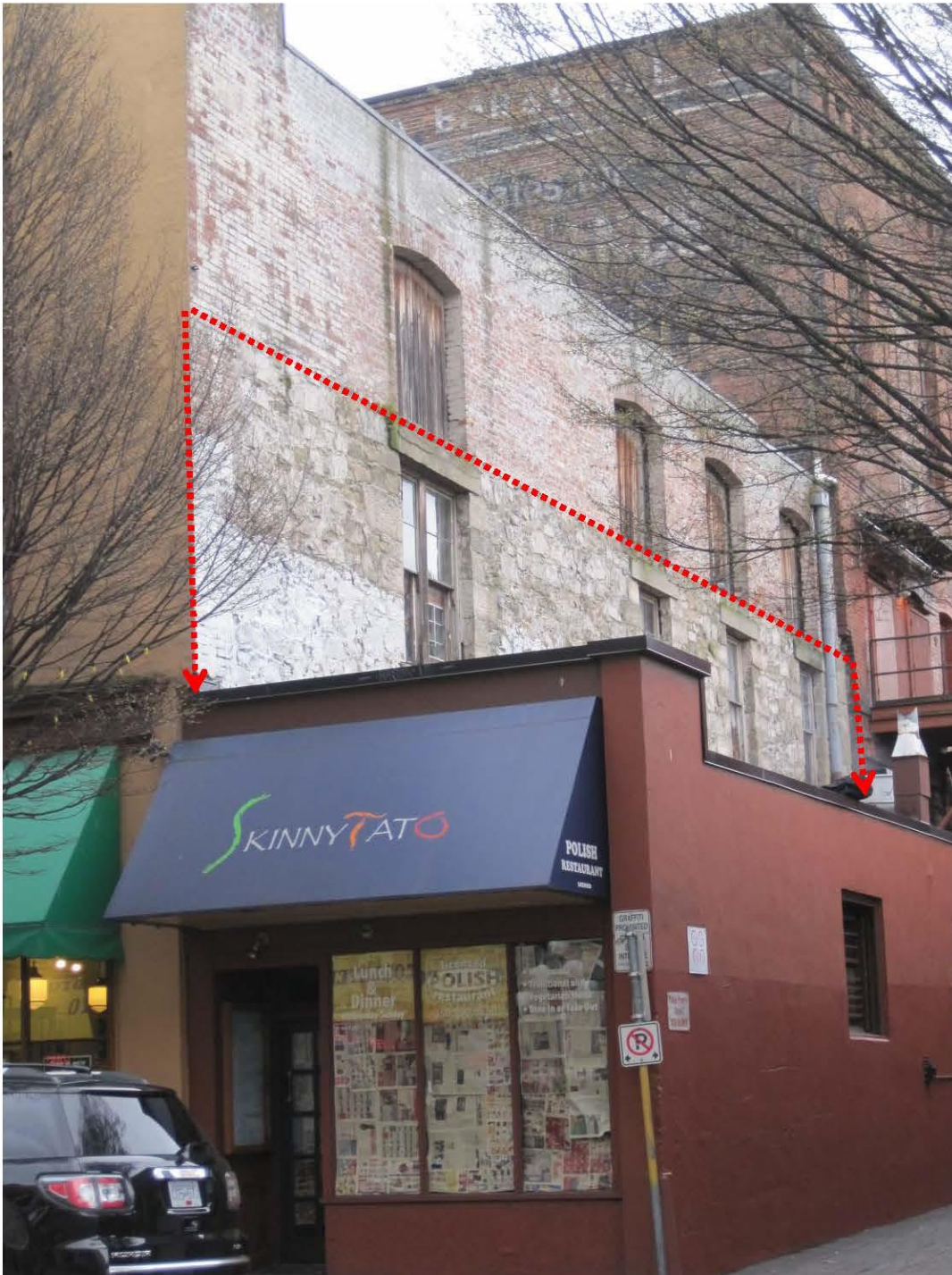
Photograph of Visible Portions of the Rubble Wall