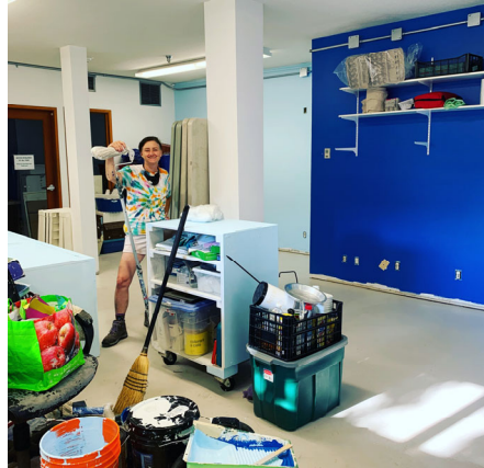
Quadra Village Arts Hub: Renovation in progress