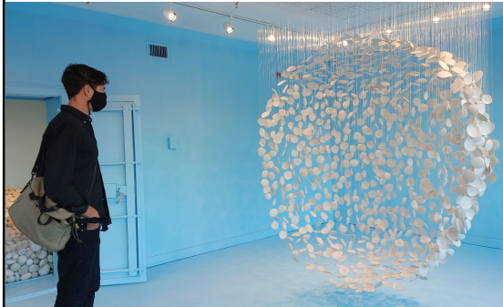
Victoria Arts Council: New Gallery Lighting