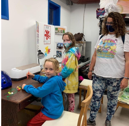
Quadra Village Arts Hub: New arts space and tool library