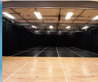
Dance Victoria: Black box theatre space - New track lighting & curtains