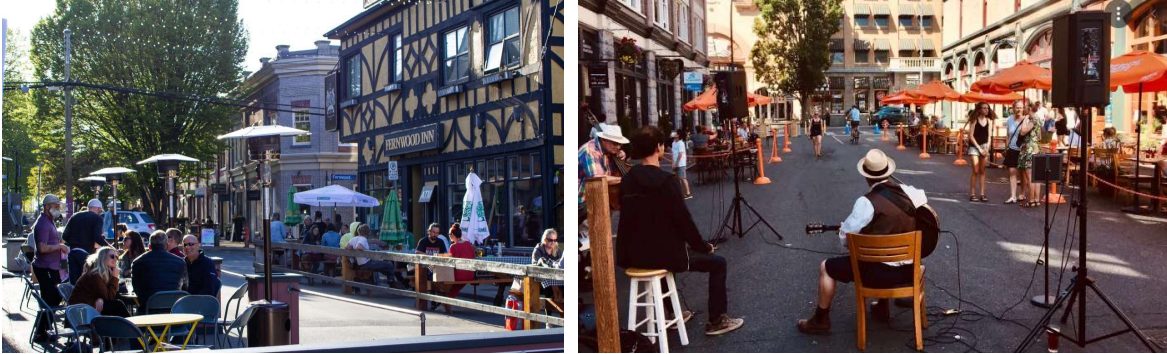
Gladstone Avenue & Broad Street