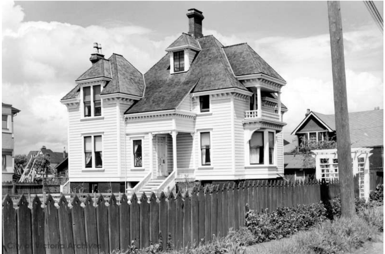
Thomas Kain House- Northwest corner of Dallas Road and Lewis Street