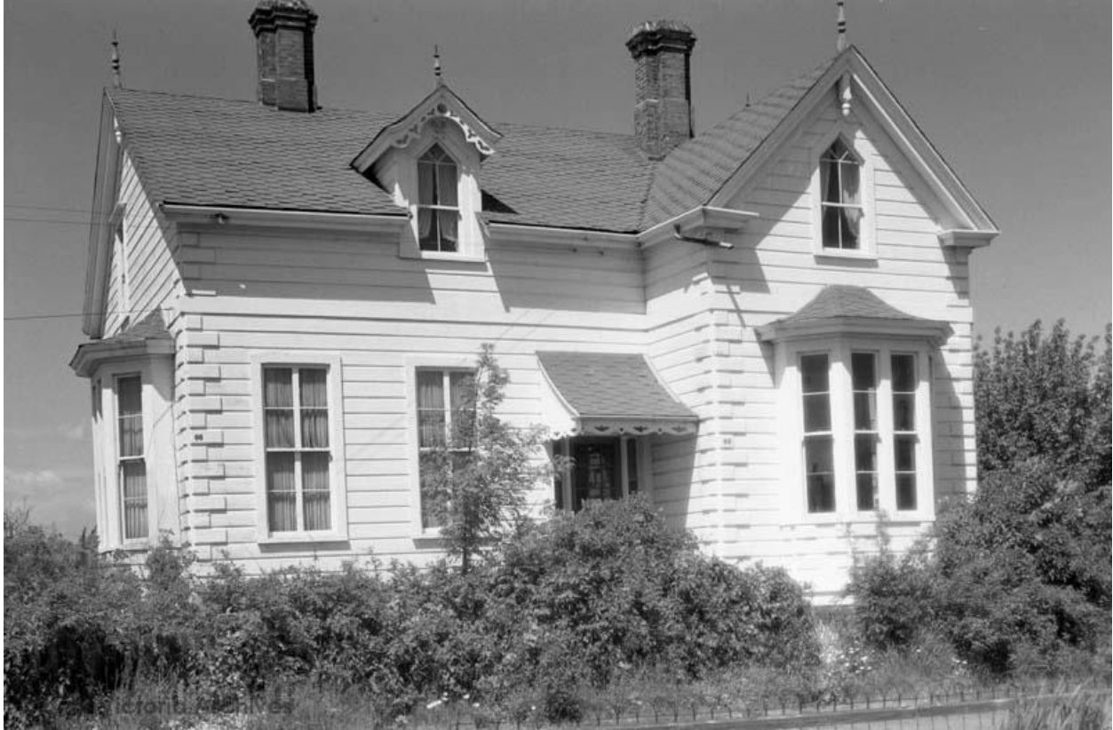
Gladys Villa, built in 1876 (Photograph c. 1950s)